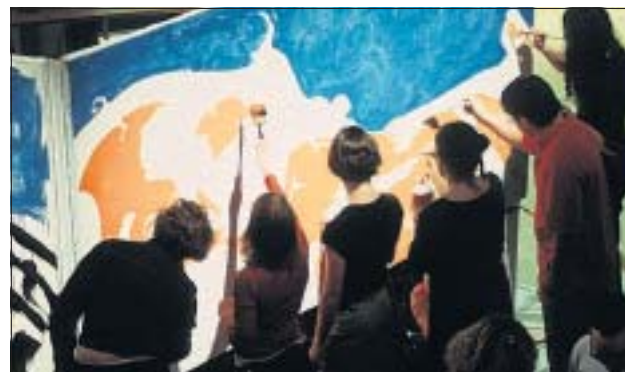
Top billing: Kiefer Sutherland (left) and Steve Coogan (top) will be on the credits for The 1 Second Film, an animation of 12 giant paintings